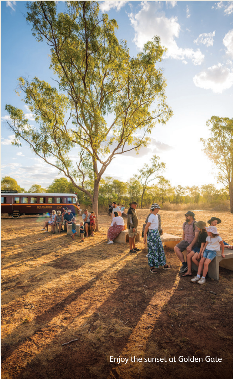
Enjoy the sunset at Golden Gate