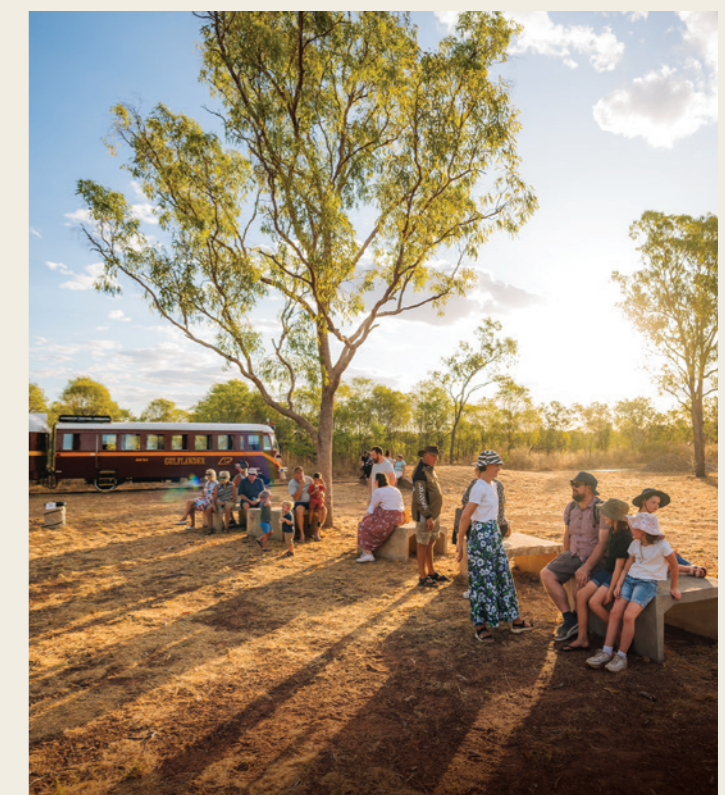
Enjoy a sunset at Golden Gate

From Croydon, you can also take a Trans North Bus back to Normanton in the afternoon. Advance bookings are required as seats are limited. To book a bus seat, contact Trans North Bus on 07 3036 2070.