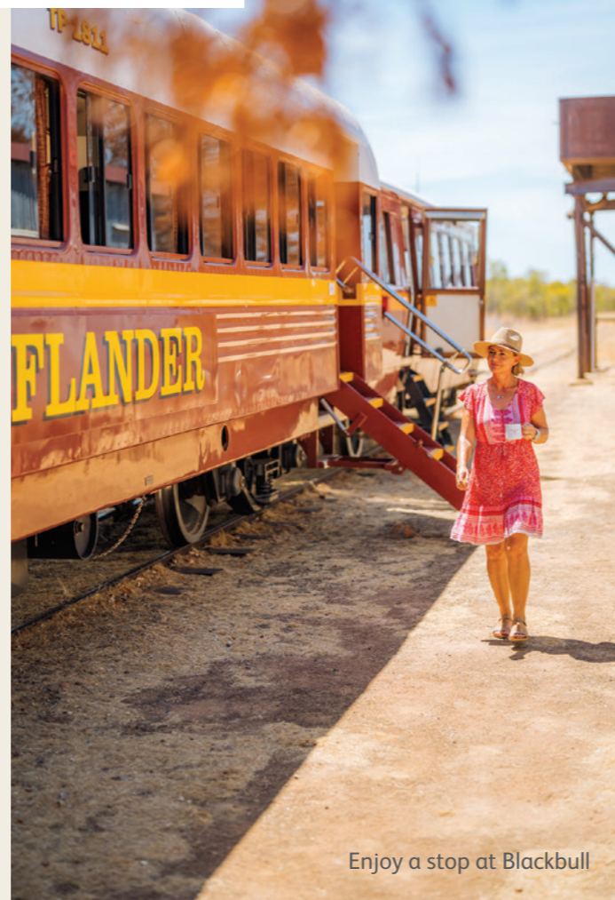
Enjoy a stop at Blackbull